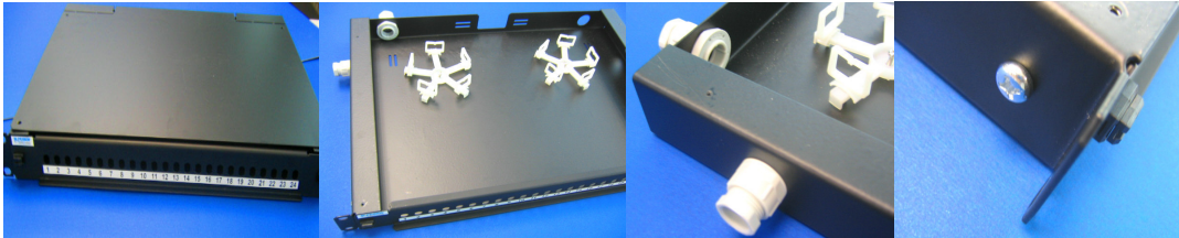
Rack Mount Fiber Termination & Splicing Box